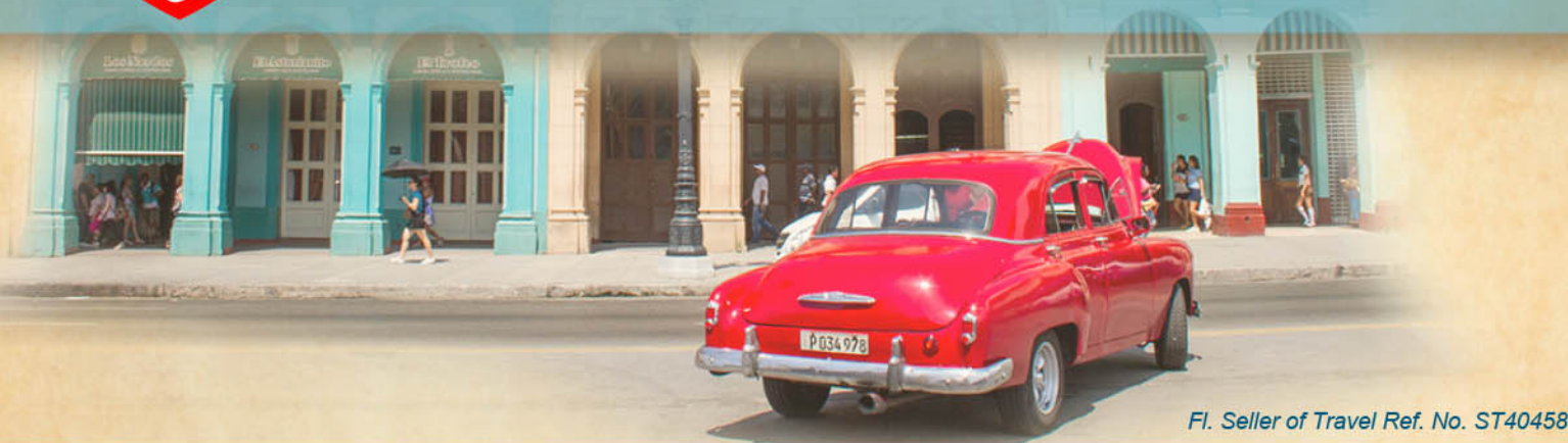
Fl. Seller of Travel Ref. No. ST40458